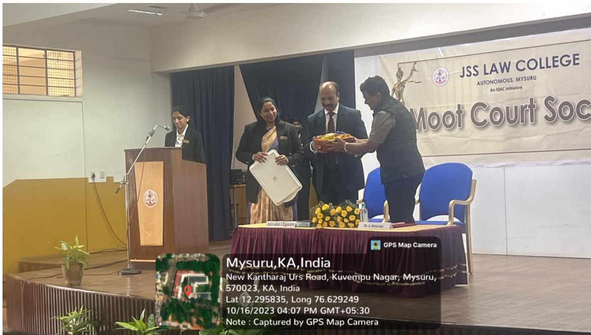
Picture: Vote of Thanks