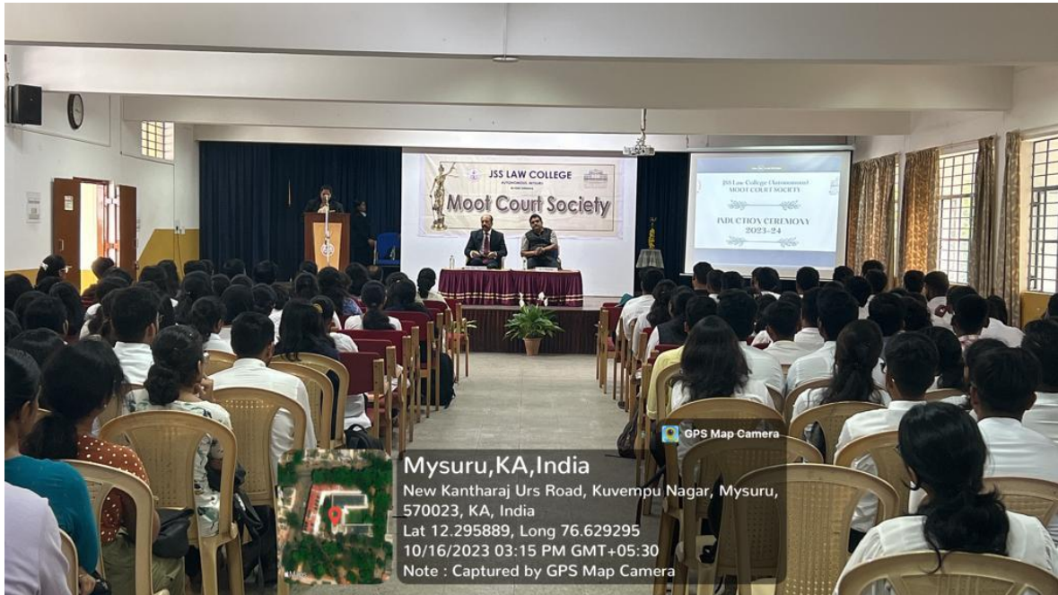
Picture: Welcome Address