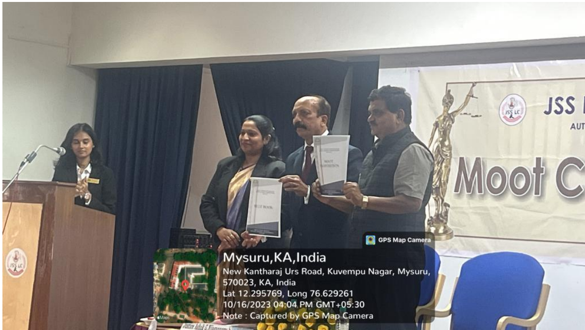
Picture: Release of Inter- College Moot Problem